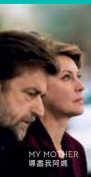
MY MOTHER 導盡我阿媽