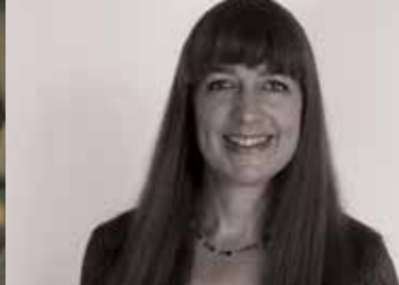
Left to right: Snowman and The Snowdog; We're Going on a Bear Hunt © Lupus Film; CAMILLA DEAKIN