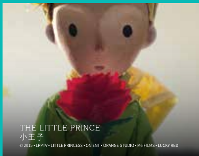
THE LITTLE PRINCE 小王子

© 2015 - LPP TV - LITTLE PRINCESS - ON ENT - ORANGE STUDIO - M6 FILMS - LUCKY RED