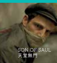
SON OF SAUL 天堂無門