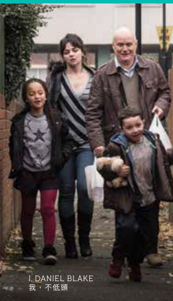
I, DANIEL BLAKE 我，不低頭