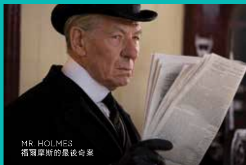
MR. HOLMES 福爾摩斯的最後奇案