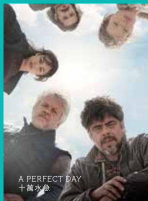
A PERFECT DAY 十萬水急