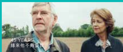
45 YEARS 緣來他不够愛我